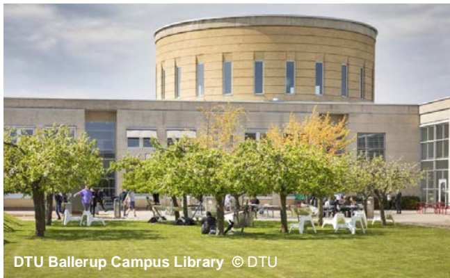
DTU Ballerup Campus Library

Paper Submission: February 1, 2026 Authors' notification: March 1, 2026 Camera-ready copies: March 15, 2026 Authors' registration: March 15, 2026 Conference date: June 15 - 17, 2026