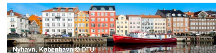
Nyhavn, København